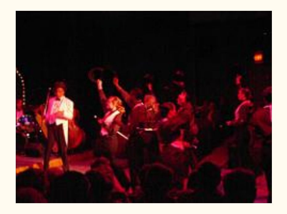
It's YOUR show now!